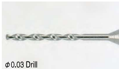
\phi 0.03 Drill

All sizes with diameter tolerance 0/-0.003 and shank diameter tolerance h4 can be used with shrink-fit holders.