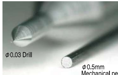
\phi 0.03 Drill