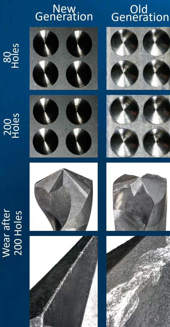
Tungsten Carbide K40-UF